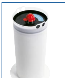
Replacement cartridge PURITY 1200 Clean