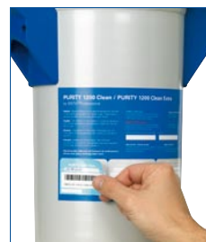
...stick it on the pressure vessel.