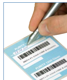
Write the installation date on the sticker and...